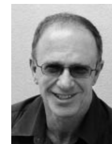
Peter Piot Executive Director, Joint United Nations Programme on HIV/AIDS and Under Secretary-General of the United Nations

I hope that the Congress represents an opportunity to renew our resolve, to broaden our understanding of the multi-faceted scope of HIV and its impacts, and to embrace a common purpose in meeting these challenges.